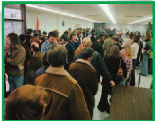
▼ Lines of jobseekers at an unemployment office

For years, the Organization of Petroleum Exporting Countries (OPEC) sold oil for its member countries. Prices remained low until the early 1970s, when OPEC decided to use oil as a political and economic weapon. In 1973 the Yom Kippur War was raging between Israel and its Arab neighbors. Tension had existed between Israel and the Arab world ever since the founding of modern Israel in 1948. Since most Arab states did not recognize Israel's right to exist, U.S. support of Israel made American relations with Arab states uneasy.