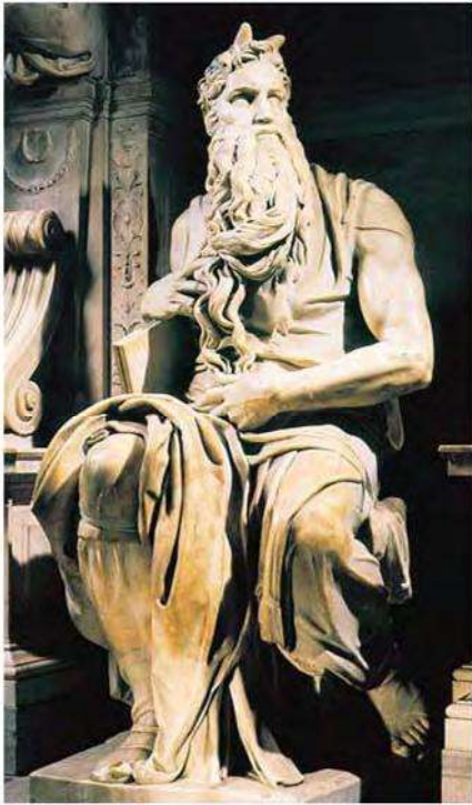
▲ This statue of Moses was carved by Michelangelo.

The God of Abraham The Bible tells how Abraham and his family roamed for many years from Mesopotamia to Canaan to Egypt and back to Canaan. All the while, their God, whose name was Yahweh, watched over them. Gods worshiped by other people were often local, and were associated with a specific place.